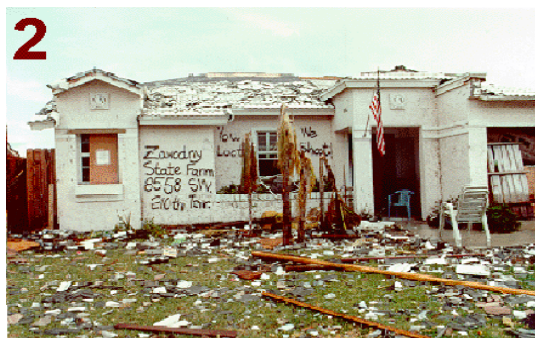
MAJOR DAMAGE HABITABLE