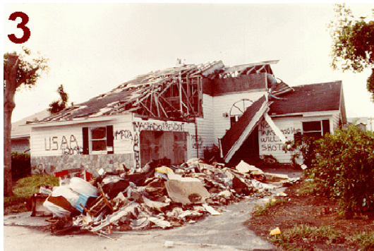
MAJOR DAMAGE UNINHABITABLE