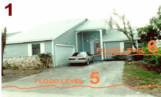
NO/MINOR DAMAGE HABITABLE